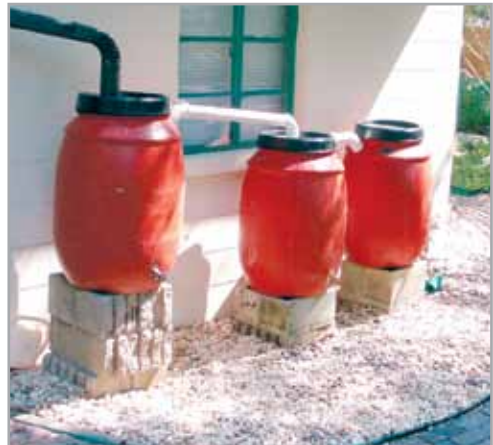
Multiple barrels provide for greater water storage.

Cisterns and rain barrels have been around for thousands of years and the time has come for more homeowners to enjoy their benefits.