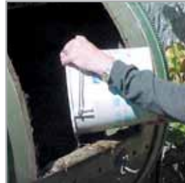
Use to keep compost bin moist.