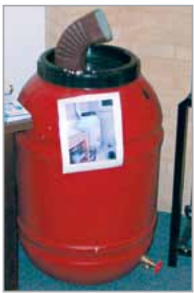
Hillsborough County Extension Service has a demonstration rain barrel.

Many county Extension offices have rain barrel demonstration exhibits where you can see examples of rain barrels that any homeowner can install. The Extension offices also provide an abundance of information on plants, gardening, composting and water conservation. Most county Extension offices offer workshops on all of these subjects.