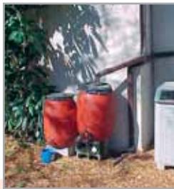
Gutters and downspouts funnel rainwater to the rain barrels.

Most storage tanks are placed above ground to take advantage of the force of gravity. A below-ground tank requires a pump to get the water out. This increases the cost and maintenance of the system.