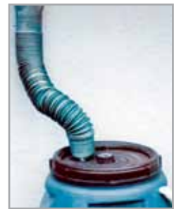
Flexible downspout extender