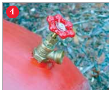
The rain barrel outlet is now complete.