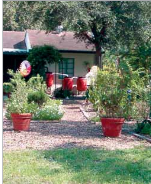
Rain barrels are one component of this water-efficient landscape.

Although a small rain barrel may not provide all the water needed to sustain your plant material, it can certainly supplement your current watering schedule. Planter beds, vegetable or flower gardens and potted plants can easily be irrigated with the water from a rain barrel.