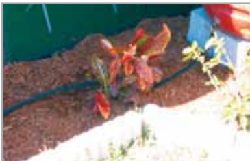
Attach a soaker hose to water nearby plants.