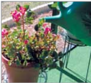
Hand water plants.

soaker hose or a length of PVC pipe or garden hose with holes punched in it may work with these low pressures. If using a soaker hose, take out the pressure-reducing washer to allow more water to flow through the hose ( bottom right ). Filling a watering can to water plants around the yard is always an option. You can also use the water to keep your compost bin moist or to rinse off gardening tools.