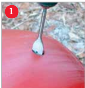
First, drill hole near bottom of barrel.

barrel. This will provide a few inches of clearance for attaching a hose or filling a watering can. This also allows room for debris that enters the barrel, such as leaves, to settle below the level of the outlet, which prevents clogging.