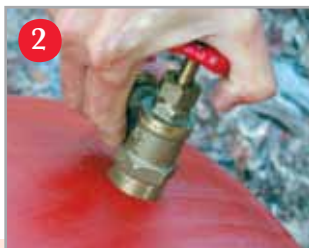
Next, screw in the hose spigot about halfway. Make sure the threading is going in straight, as this will help prevent leaking.