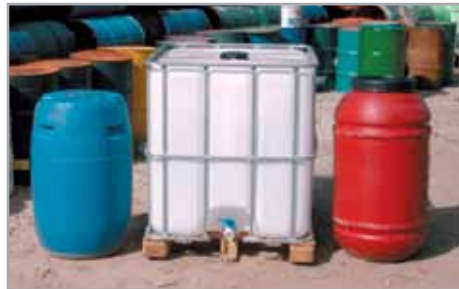
Some common containers used for rain barrels are (left to right): 50-gallon sealed barrel, 275-gallon juice container, 50-gallon open-top barrel.