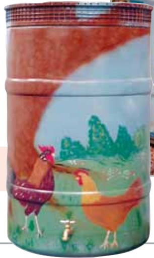
Rain barrels may be painted to increase their aesthetic value.