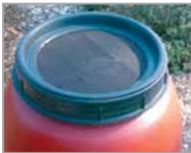
A barrel covered with window screen can be placed under a roof valley to collect rainwater runoff.

Elevating the rain barrel on a platform, such as cinder blocks, will give additional water pressure and will provide clearance for connecting a hose or filling a watering can.