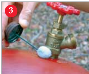
When the spigot is in about halfway, apply a liberal amount of PVC cement to the exposed threads. Continue to screw in the spigot until it is snug and pointing toward the bottom of the barrel.