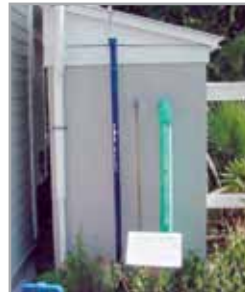
These cisterns at the Florida House Learning Center each hold 2,500 gallons of rainwater.