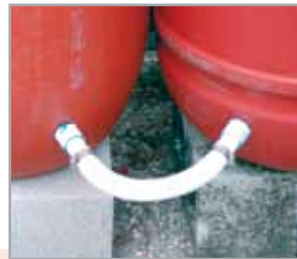
Connecting rain barrels together will allow for more water collection.