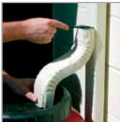
Mark downspout for cutting

To make the transition from the gutter/downspout to your opening in the rain barrel, you can fabricate a crosspiece out of downspout material or purchase a flexible downspout extender. The flexible downspout extender eliminates the need for exact measurement because it bends and stretches to the length you need. Make sure the downspout extender fits the size of your downspout.