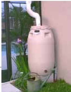
This barrel was painted to match the house color.

Outdoor acrylics and spray paint work well, but the barrel must first be primed so these materials adhere properly to the surface. A product on the market is a spray paint designed specifically for outdoor plastic furniture, but it will work on almost any plastic surface. The benefit to this product is that the barrel does not have to be primed before applying the spray paint. If using spray paint but need to paint small details, spray some paint into a small cup, making a liquid puddle. This paint can be brushed on.