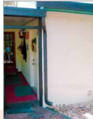
A good spot for a rain barrel.